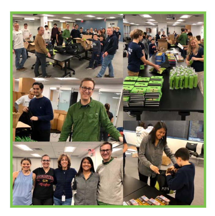
Bite Me Cancer volunteers assembling Teen Support Bags.

Also, once a month a small group of our volunteers serves dinner to the families battling cancer on the Pediatric/Oncology Unit of INOVA Children's Hospital.