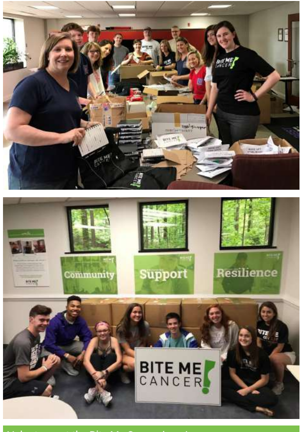
Volunteers at the Bite Me Cancer location

All Bite Me Cancer work is conducted by volunteers.